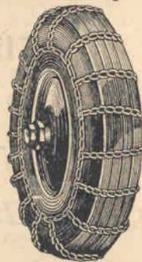
BALLOON TIRE CHAINS